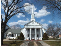
Children and Youth