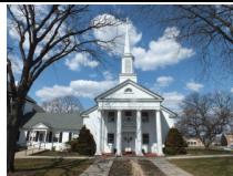
Children and Youth

On Sunday October 15, 2017 Cedarville UMC will celebrate Laity Sunday. This is a Sunday in which all United Methodist churches recognize and celebrate the role of the laity (you and me) in the mission of the church. For the past 2 years we have used this as our Laity Day of Service. This year will be a little different. With a single unified worship experience that day we will celebrate the ministry that the laity bring to this great mission we call the church. There will be additional information and details in the October Crossbeams and in the bulletins. Please plan to join together with your brothers and sisters in Christ, on October 15, to worship and celebrate all that the Lord is doing in this place.