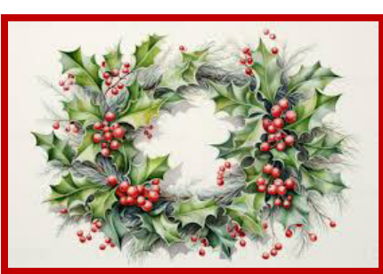
December Worship Helpers